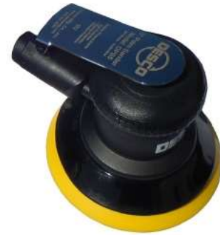
160.010 without Dust Collection