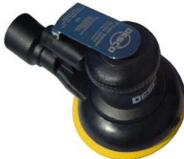
160.011 with Dust Collection