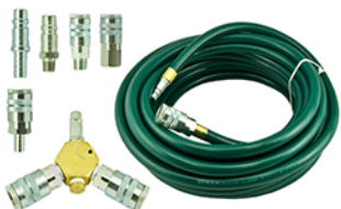
Hoses & Fittings