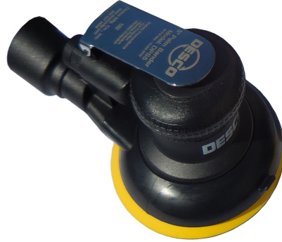
160.011 with Dust Collection