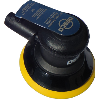
160.010 without Dust Collection